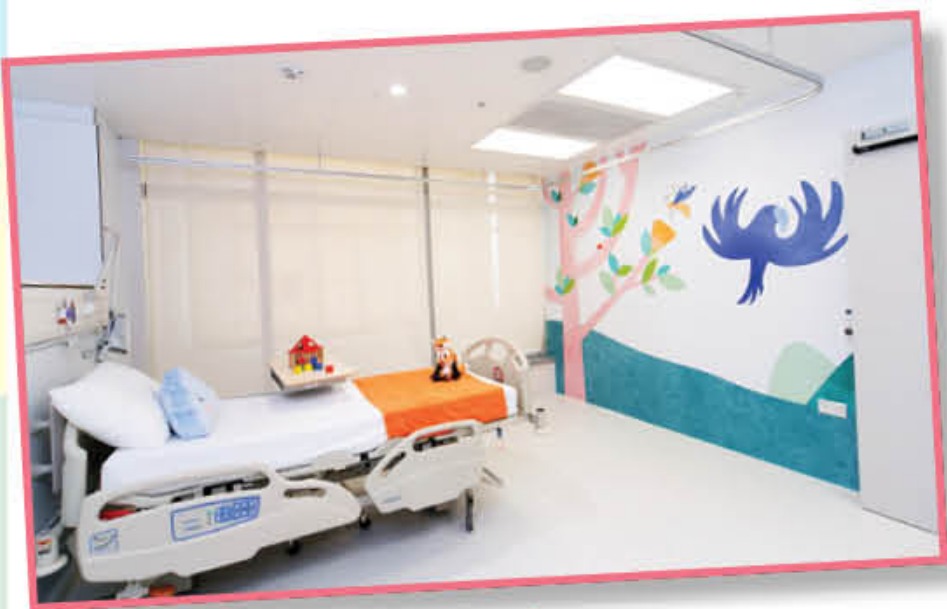
鮮明的色彩，為隔離病房平添生氣。 A beautiful choice of colours give life to the isolation room.

The eight animal characters that have been used as friendly hosts of HKCH are Monkey, Flamingo, Panda, Kangaroo, Parrot, Koala, Pink Dolphin and Octopus. The energetic and playful monkeys will appear on the first floor to cheer up our children attending the Specialist Outpatient Clinic. The flamingos on the second floor will support young patients in the Radiology Unit and Rehabilitation Centre to stay calm and balanced during procedures and therapies. The fourth floor with the Neonatal Intensive Care Unit will be the home of kangaroo mothers and babies. They will accompany the seriously-ill neonates and their carers through the tough time in life, and symbolise the strong bonding between parents and babies.