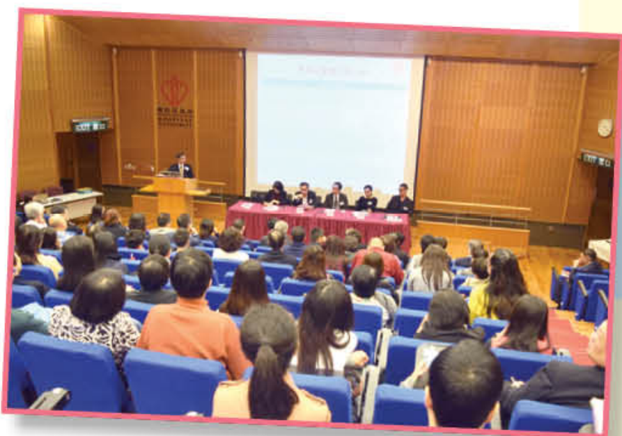
簡介會讓香港兒童醫院與持份者互相交流。 The briefing session by HKCH made a successful engagement with its stakeholders.

一樓用馬騮仔，是希望到專科門診看病的小朋友見到時，同樣開心活潑；二樓放了丹頂鶴，是想小朋友到放射治療部或復康中心進行檢查或療程時，以丹頂鶴做榜樣，保持心情平靜；而四樓的初生嬰兒深切治療部，就用了袋鼠媽媽與BB，令病童看到牠們，就如自己有媽媽陪伴在側，不會害怕。外國的兒童醫院利用動物圖案有不錯的成效，香港借鏡加上詳細諮詢病童、家長和醫護人員的意見，最後「扑槌」選定這八種動物。